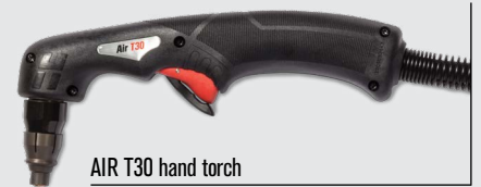
AIR T30 hand torch