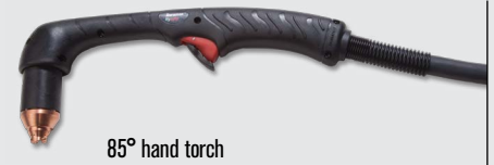
85° hand torch

Duramax Hyamp standard torch styles (for more torch options, see www.hypertherm.com )