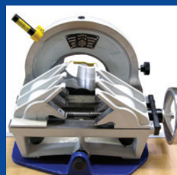
Hardened cast iron clamping jaws – stainless steel caps optional available.