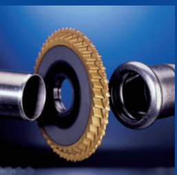
Square, burr-free and deformation-free pipe end – ideal for press fitting applications!