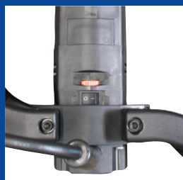
Powerful drive with overload protection and ergonomically designed motor handle.