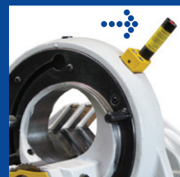
Integrated laser pointer to mark the cut off point.