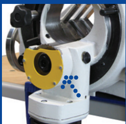
Second saw blade position to cut off elbows.